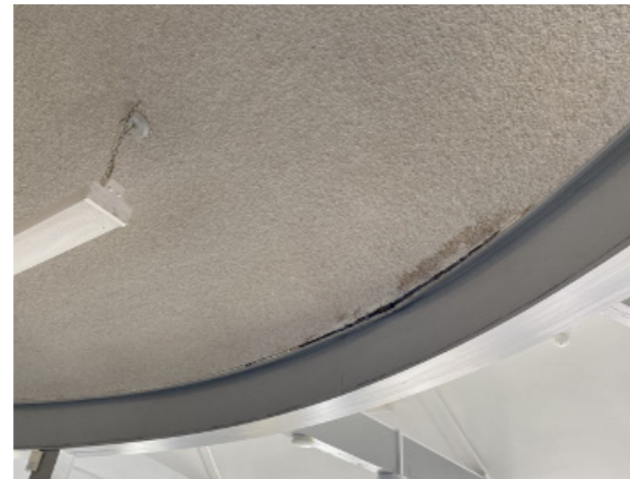
Sprayed coating on ceiling