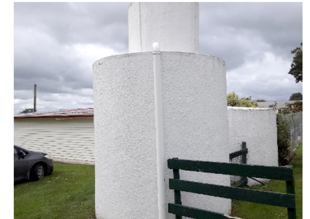
Concrete render around structure