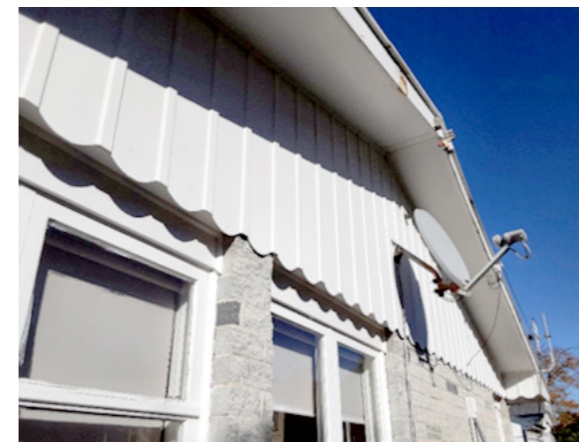
Asbestos cement soffit and gable Common to many houses