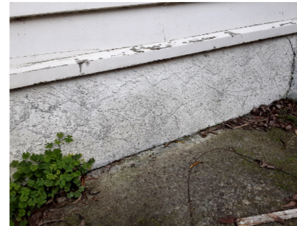
Backing boards Generally found around foundations externally