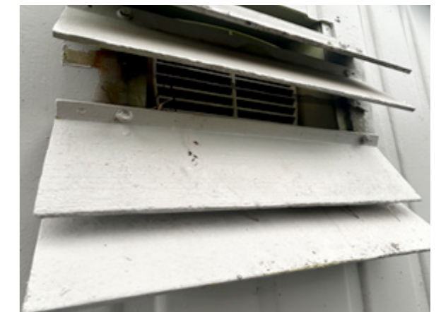
Asbestos containing material type cladding and louvres Common to commercial and industrial properties