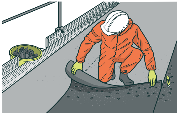
FIGURE 2: Remove sections gently to minimize disturbance