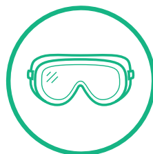
SPLASH RESISTANT GOGGLES