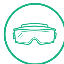
GAS RESISTANT GOGGLES