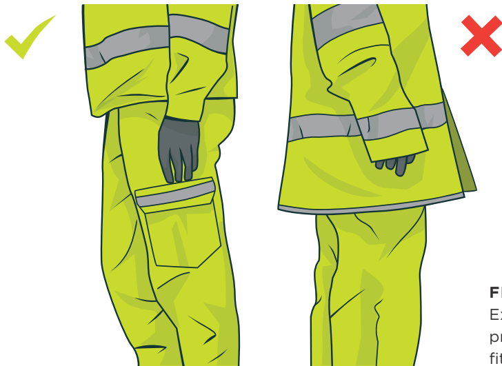
FIGURE 2: Example of well-fitting protective clothing and poorly fitting protective clothing