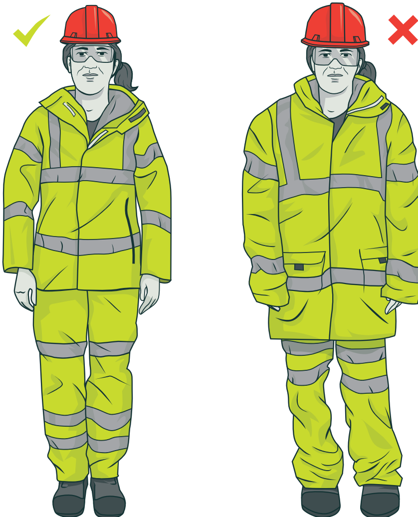
FIGURE 3: Example of well-fitting protective clothing and poorly fitting protective clothing for women

You should engage with your female workers on what the best protective clothing options are for them. Many PPE suppliers provide PPE specifically for women. Ask your supplier what they can offer that meets the PPE needs of women. They may be able to add to their range.