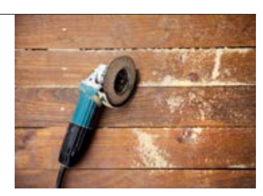
Wood dust from using an electric grinder