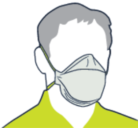
Disposable half-face respirator