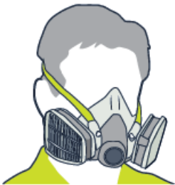
Re-usable half-face respirator (cartridge)