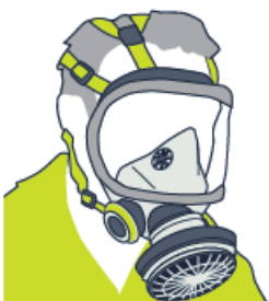
Full-face respirator (cartridge)