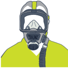
Full-face powered respirator (cartridge)